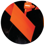
Heavy Duty Scrapper