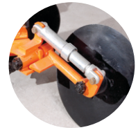
Coulters + Shocker Disc Assembly