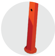
Stand For Easy Storage